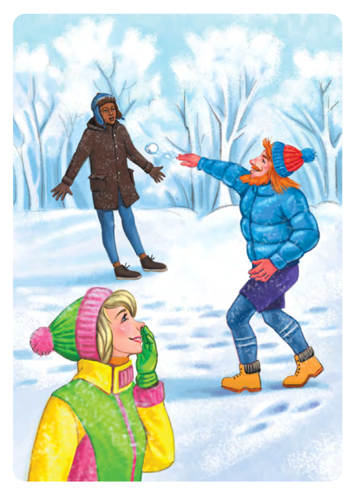
Agnar threw the ball of snow at Jua. Jua was surprised.

Agnar got some snow. He made it into a ball. He threw the ball of snow at Jua. Jua was surprised. Now he was cold and wet again.