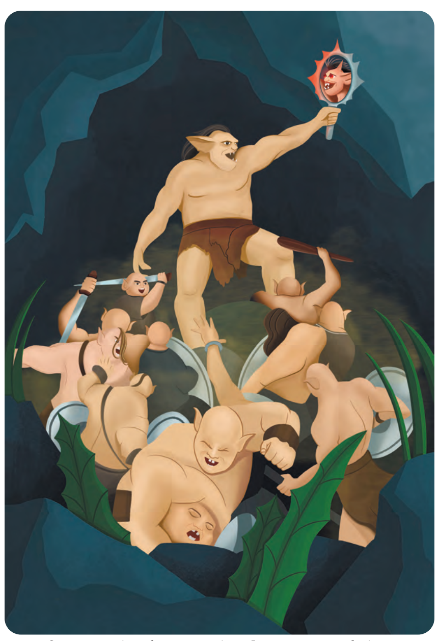
Once upon a time, there was a mirror. It was not a normal mirror. It was a magic mirror.