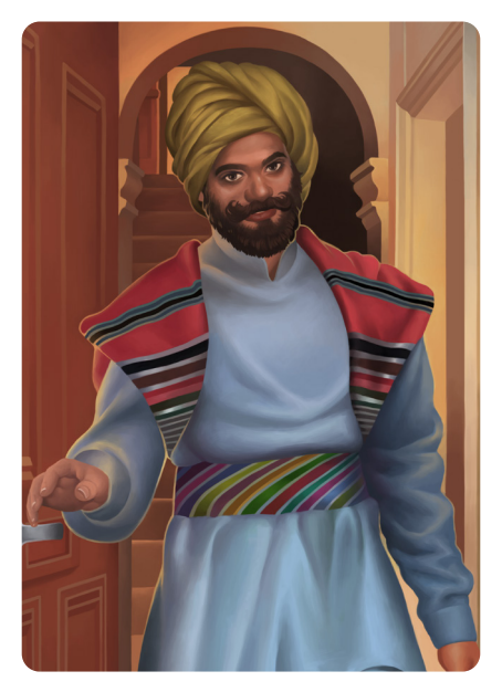
An Indian man opened the door and took us inside a big house.

frown (verb) to make a serious or angry facial expression by moving your eyebrows