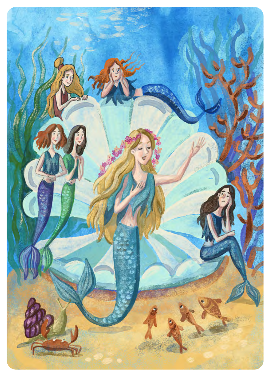
The six mermaids were all beautiful, but the youngest was the most beautiful.