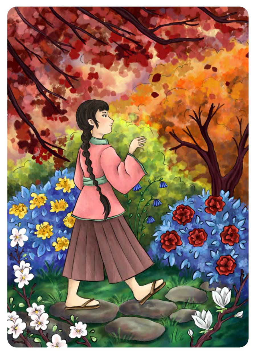
She walked into the garden to see how big it was.