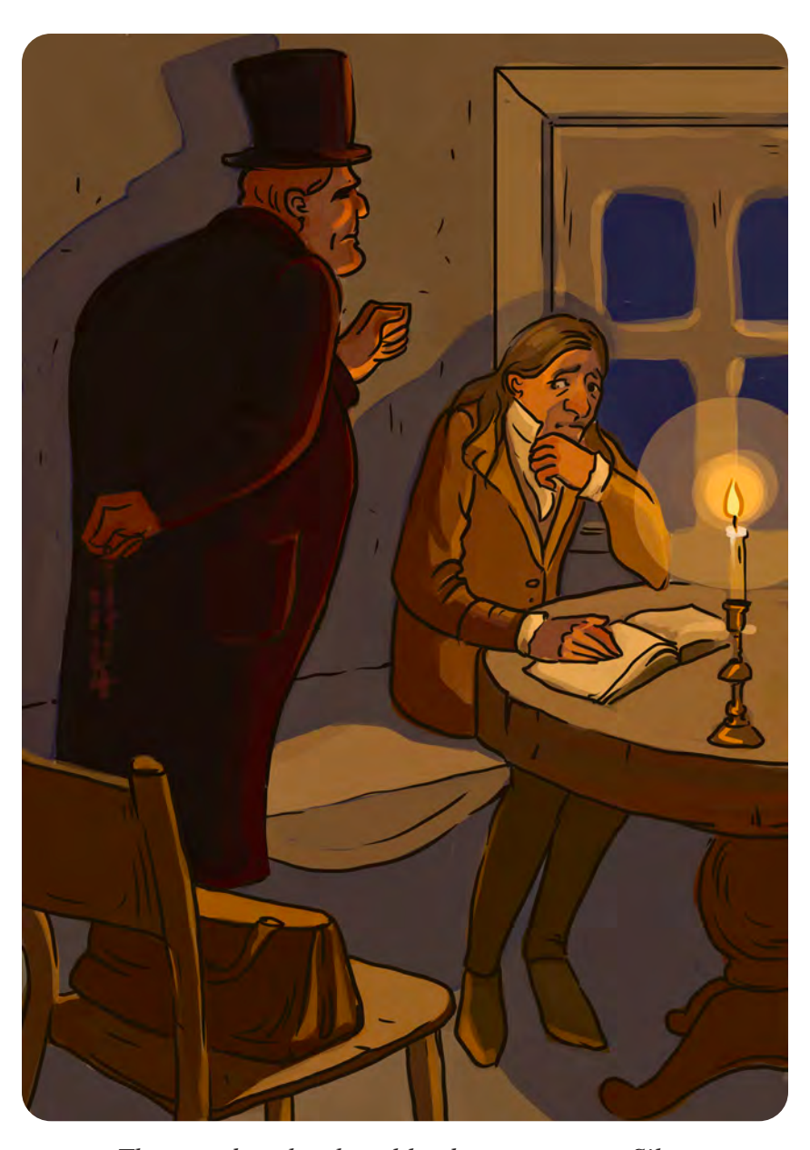
The next day, the chapel leader came to see Silas. 'Did you steal the money?' he asked Silas.