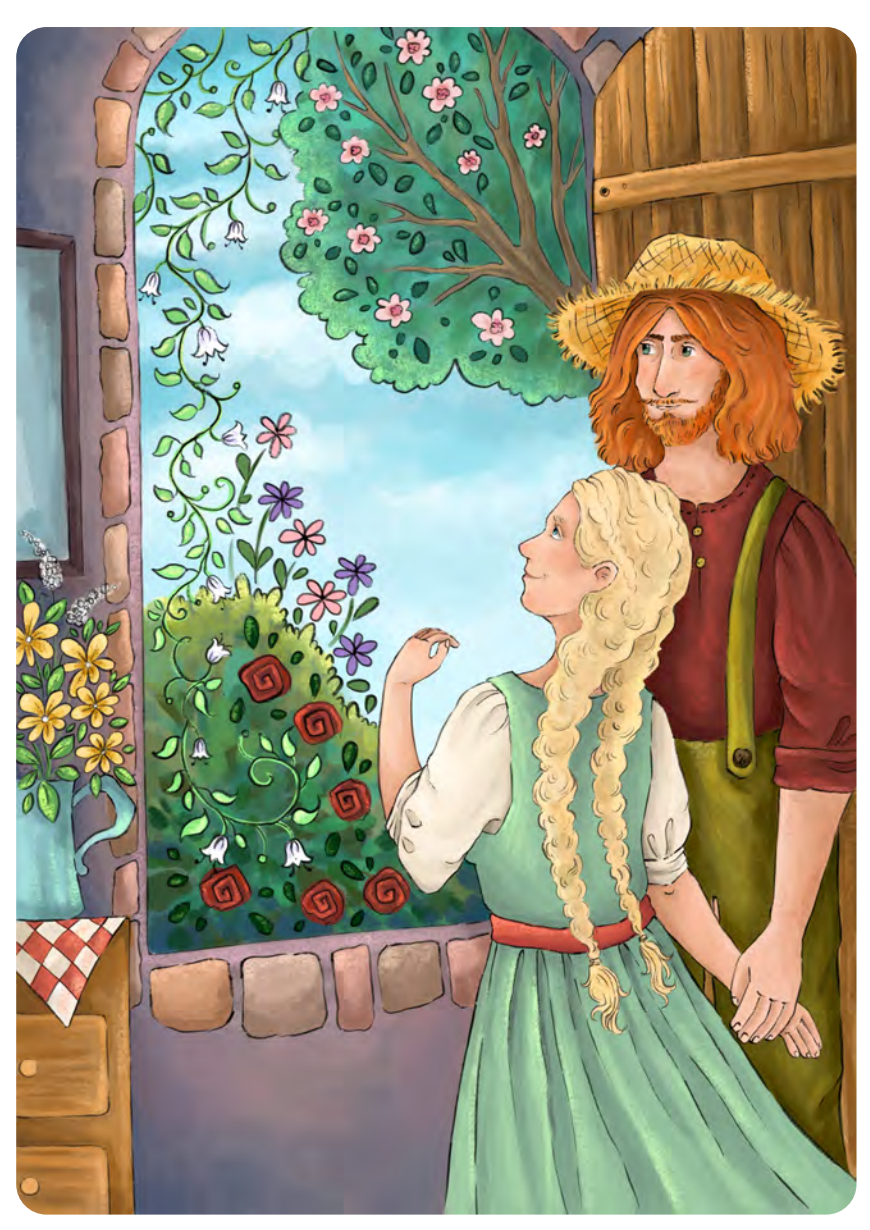
Only the man and his wife could see into the garden from the window in their house.