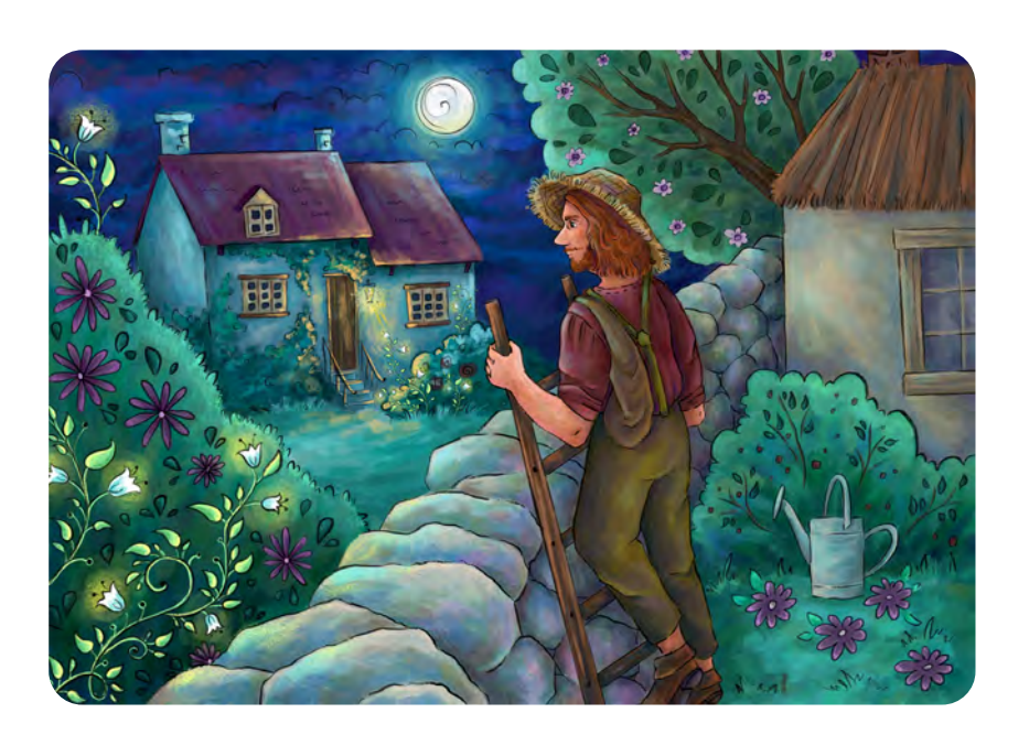
That night, by the light of the moon, the man took his ladder and climbed the wall to take some rapunzel from Dame Gothel's garden.