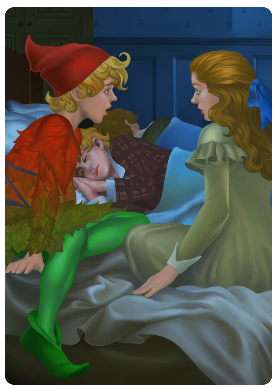
Wendy and Peter sat down together, and Wendy asked him some questions.