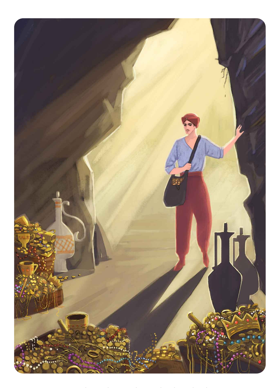
He took one bag and went back to the door.