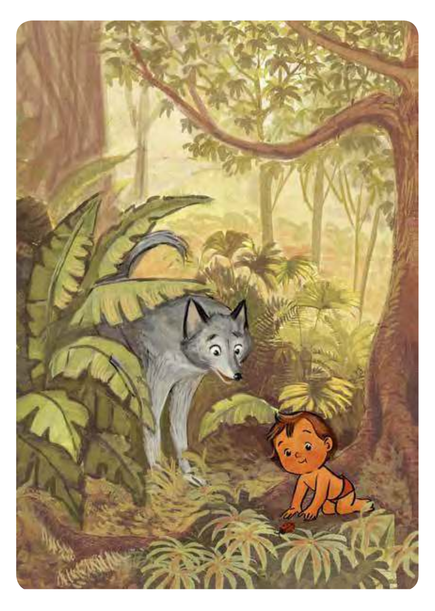
Father Wolf was walking through the jungle. A man cub walked up to him.