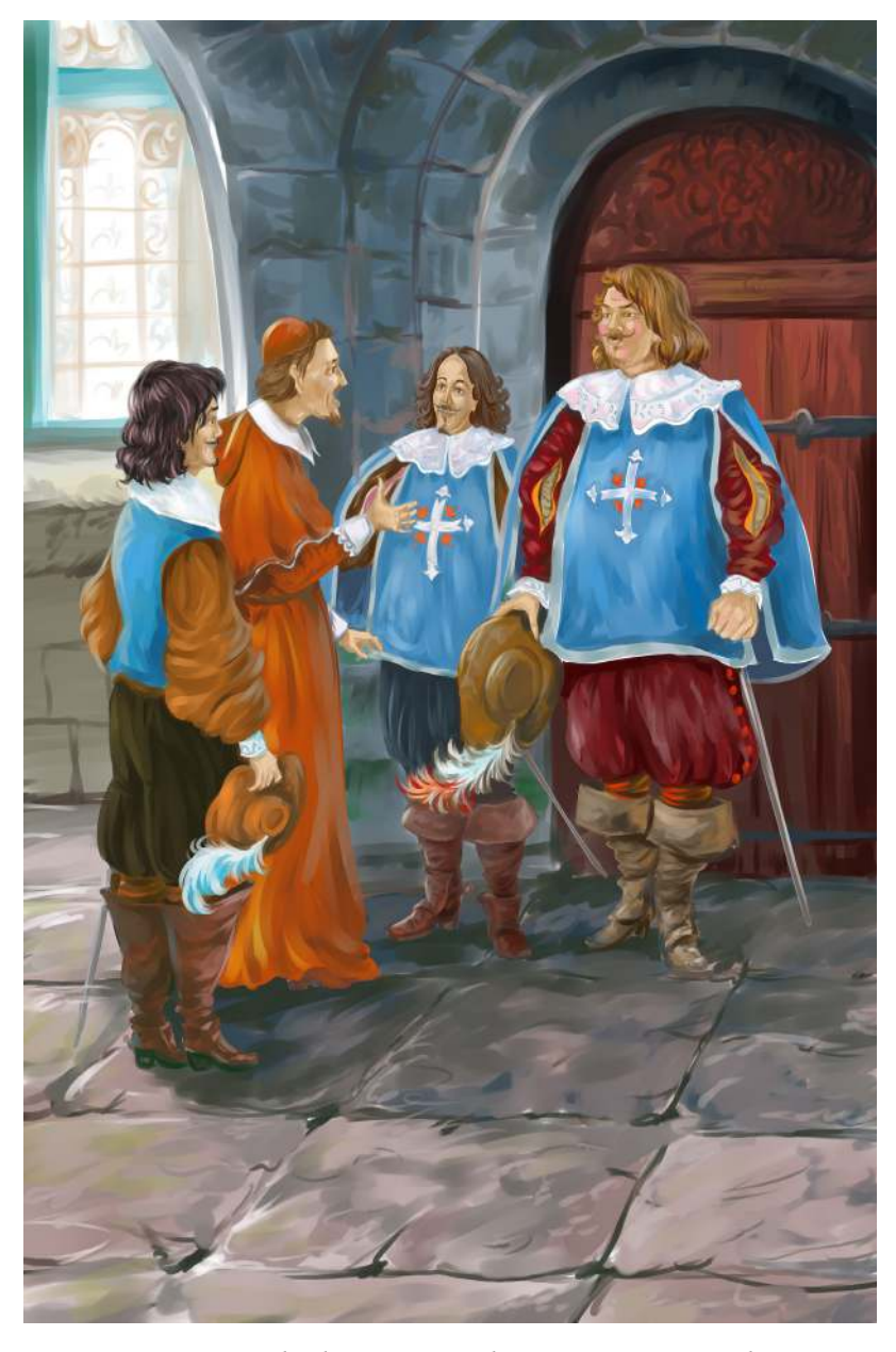
D'Artagnan watched as two musketeers came into the room.