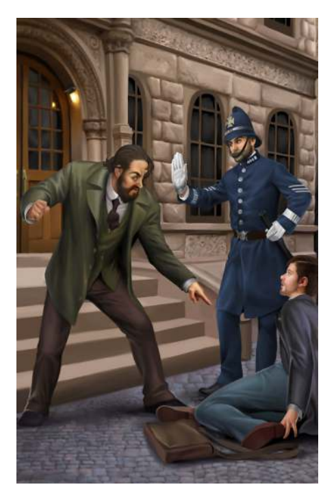
"Stop! What's going on?" the policeman asked.

"Come inside. I want to talk to you," said the professor.