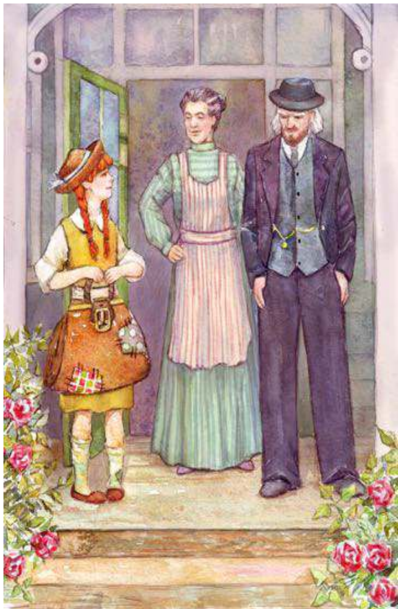
Marilla opened the door. She was surprised to see a girl.